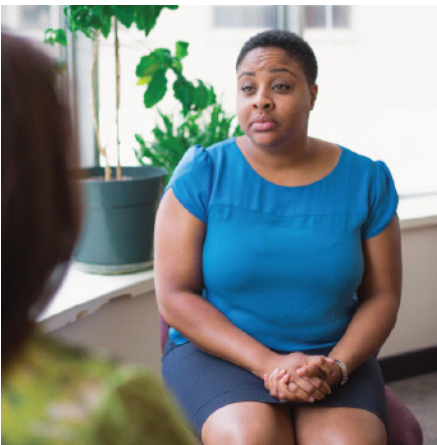
A counsellor at Catholic Family Services of Toronto